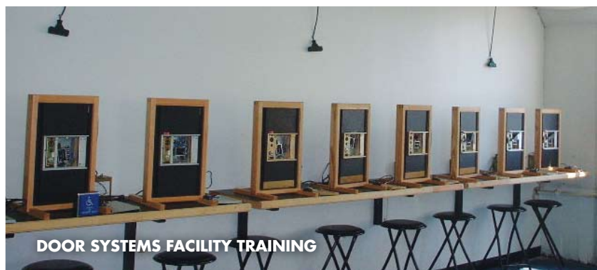
DOOR SYSTEMS FACILITY TRAINING