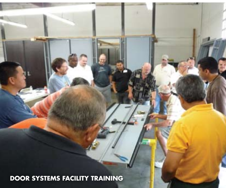
DOOR SYSTEMS FACILITY TRAINING